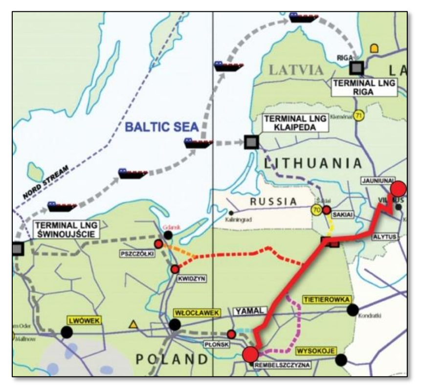
Fig. 2. Proposed location of the Gas Interconnection Poland – Lithuania (GIPL).