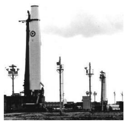
Thor Missile circa 1958

Whereas Norstad oversaw the creation of a NATO nuclear weapons stockpile under dual -key arrangements, his goal was to establish a truly European nuclear force whereby the US would supply NATO nations with nuclear technology and systems, and the Europeans would have the primary control of the weapons under guidelines set by The genesis of the Multilateral Force (MLF) concept, SACEUR. Norstad's idea was picked up and backed by the State Department in 1960. The MLF negotiations that continued into the 1960s would eventually founder due to French President Charles de Gaulle's insistence on French control of nuclear weapons on French soil, and the demand that the US assist France in developing her own independent nuclear force. Although willing to compromise on numerous nuclear issues, neither Norstad nor the US government could accept the French positions. It would lead eventually to France's leaving the military side of NATO in 1966.