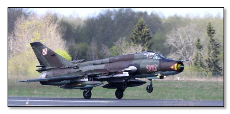
Fig. 3. Polish Su-22 in exercise "Spring Storm" in Amari air base in Estonia (May 2013).