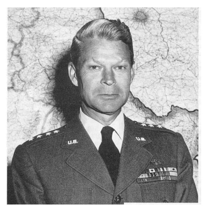
Norstad as SACEUR circa 1960