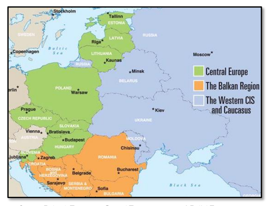
Fig. 1. Poland and the Baltic States.

contemporary challenges, which are differing in nature. The document stated that it was important to preserve and develop security cooperation with partners in the Central Europe and also the Caucasus. It was also highlighted that the Baltic region was important for NATO as a part of solidarity policy and also for Polish national security in all its domains.