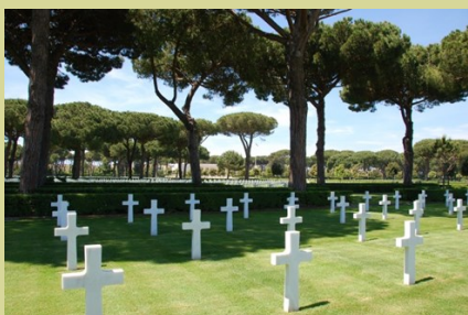
US War Cemetery in Anzio

One of the aims of the IST was to analyse a historical campaign from an operational perspective. To achieve this, prior to the tour to Italy an elective on the 1943/1944 Italian campaign was conducted. During the tour, students and staff members discussed the strategic background of the campaign, and operational objectives of the Allied and German forces.