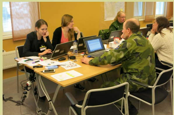
BALTDEFCOL civil servants cooperating with officers

Operational concepts used in the training reflected current operational concepts used by the UN, NATO, EU, Regional Organisations and principal International Organisations as well as Non Government Organisations.