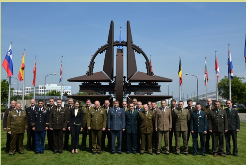
BALTDEFCOL delegation in NATO HQ

In Normandy, France students and staff members discussed various aspects of Operation Overlord, the Allied invasion of occupied Europe on 6 June 1944.