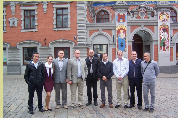
Sightseeing tour in Old Town of Riga

Finally, in each nation there was a cultural event, a tour of the capital city or a museum tour that offered the non-Baltic students the chance to see something of each country and the chance to see how each Baltic country has its own unique character.