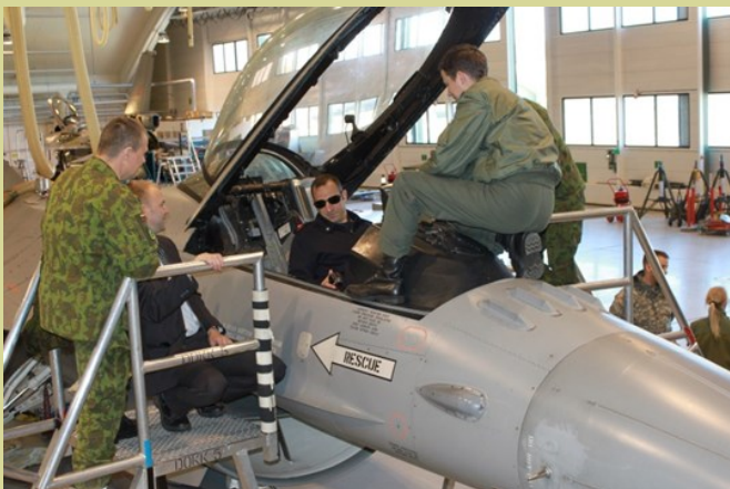
Visit to 132nd Air wing Base in Bodø

Finally, BALTDEFCOL students and staff members had a great opportunity to visit the National Defence University College located in Oslo where they listened to presentations about the Norwegian military education system and academic research conducted at the institution. The presentations were followed by an interesting overview of the security and defence policy concerning the high north, NATO, Russia and Norway.