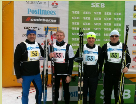
College team at Tartu Maraton Team Relay

heduled for 15 February, but due to bad snow conditions the marathon was cancelled.