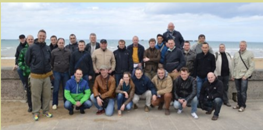
BALTDEFCOL delegation at Gold Beach, Normandy, France

mission command and initiative can mean the difference in success or failure of a mission. Lt Michael Wittman, a German tank commander, took instant initiative, without waiting for orders, attacked and single-handedly destroyed almost 30 British vehicles with his lone Tiger tank; thus, forcing the British to halt their attack.