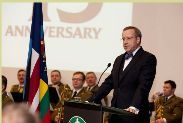
Estonian President H.E. Mr Ilves at the Ceremony