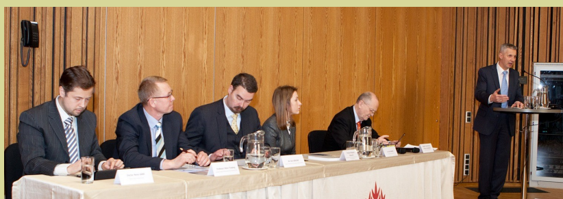
Panel of Baltic speakers at Dorpat Conference Centre