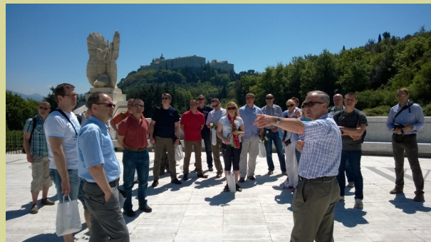
To be continued on PAGE 13

The importance of education and training was addressed during the trip to Italy by further visits to national and NATO education and training institutions. To examine the foreign educational institutions and to promote international co-operation, BALTDEFCOL delegation visited the Centre for High Defence Studies and the NATO Defense College, both responsible for educating high ranking officers in the multinational environment, and the NATO Communication and Information Systems School at Latina. Students on the Joint course in the Italian Centre for High Defence Studies were conducting an exercise applying the same Comprehensive Operational Planning Process that BALTDEFCOL students have finished studying several weeks ago.