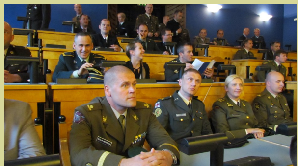
Briefings in Estonian Parliament