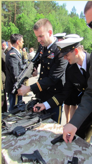
Officers in Lithuanian SOF HQs

The Study Tour was designed to broaden the understanding of the students and participating faculty members to understand the policies, current concerns and viewpoints of the Baltic military and civilian leaders. As well as meeting with senior leaders and having briefings on the military capabilities and policies of each Baltic nation, the students had the chance to go into the field and to visit key military units and installations in the region.