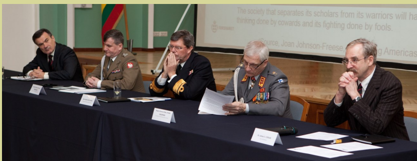
Speakers of first session of Conference at BALTDEFCOL premises

The Conference was held in two sessions—the first session was conducted at BALTDEFCOL premises with a distinguished panel of representatives of defence education institutions.