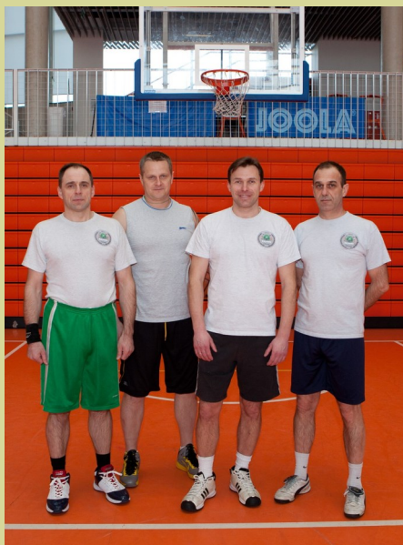
Members of winning team of Anniversary Basketball Tournament

Instructors and students of the College actively participate in different sport events. College organised Frisbee and Volleyball competitions for the JCGSC and the CSC; members of the Directing and Support Staff and student body have participated in Tartu City Marathon, Tartu Team Relay of the Tartu Ski Marathon and other competitions organised locally in Tartu.