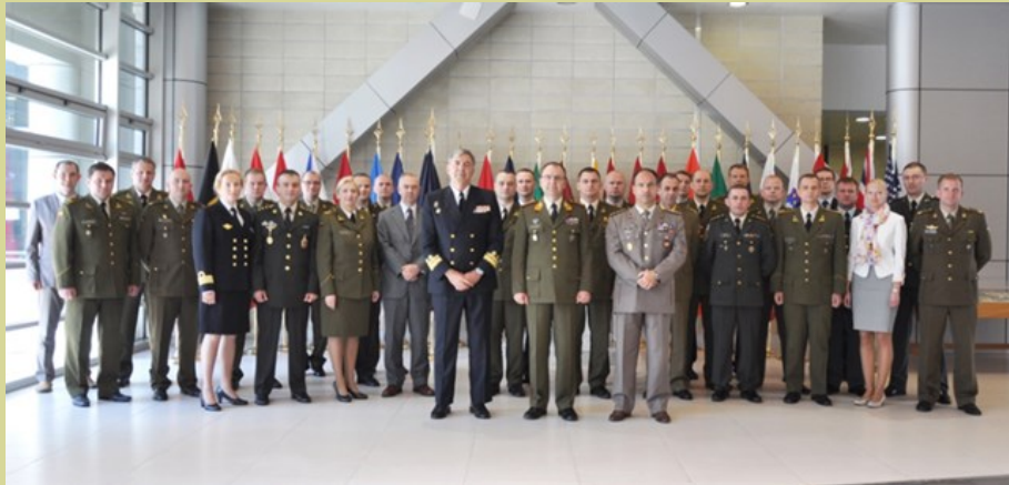
BALTDEFCOL delegation in JFC Naples