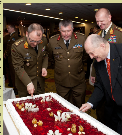
BALTDEFCOL current and former Commandants cutting the anniversary cake

The guests of the 15th Anniversary Celebration were entertained during interludes in the ceremony by musical renderings of the Lithuanian Voluntary National Defence Forces Big Band. All attending the event enjoyed the popular music stylings of this talented musical group.