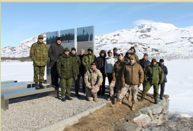
Norwegian IST group at the battlefield of Narvik

The delegation had the opportunity to enjoy free time in Bodø, Narvik and in the old town of Oslo.