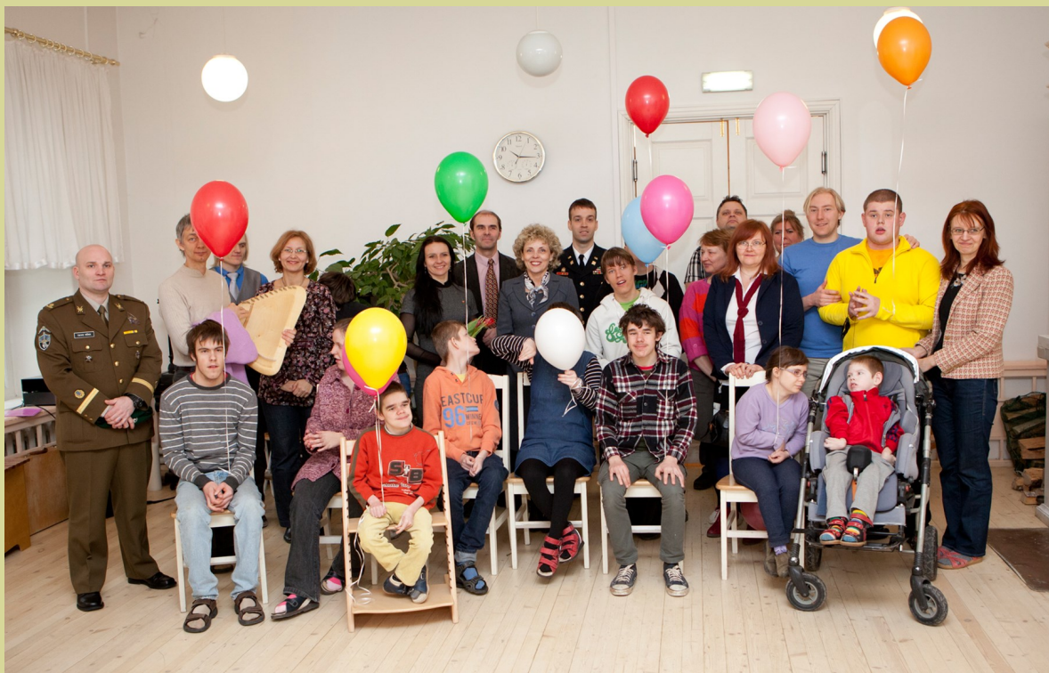
BALTDEFCOL delegation with the students and staff of Tartu Maarja School

The staff of the Tartu Maarja School were kind enough to offer a tour of the facility and were pleased to show the students receiving their lessons for the day. The tour visited various arts and crafts studios and a music room within the school. Many of the students live on site versus traveling home daily due to the location of their residences throughout Estonia.