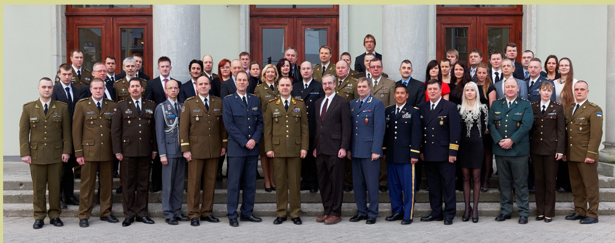
BALTDEFCOL Directing Staff and Support Staff in February 2014

Each speaker spoke about the particular needs to educate military officers in special military skills, but the evolution of conflict also means that military and civilians needs to be educated together to understand the complex issues of cyber, defence management and security.