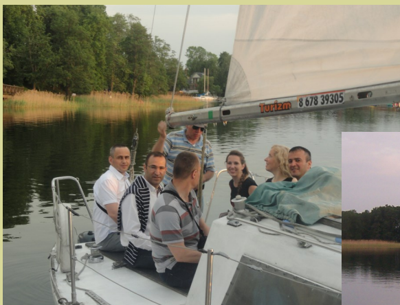
Boat trip near Trakai Island Castle

The trip is one of the last major events of the year and all agreed it was a very valuable way to close the academic year.