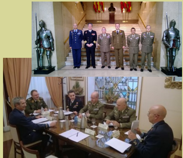
Visit to CESEDEN in Madrid